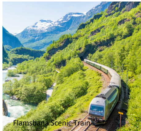
Flamsbana Scenic Train