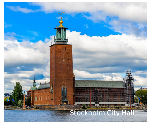
Stockholm City Hall