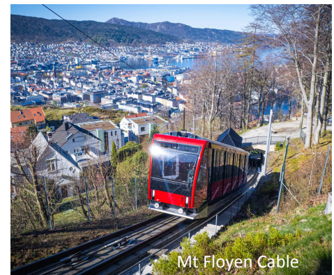
Mt Floyen Cable