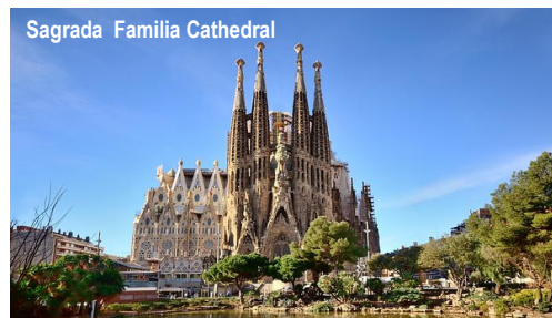
Sagrada Familia Cathedral