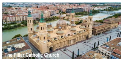
The Pillar Catholic Church