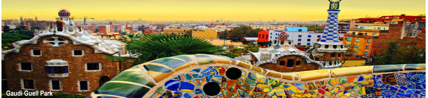
Gaudi Guell Park