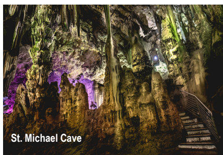
St. Michael Cave