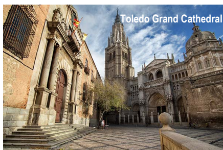
Toledo Grand Cathedral