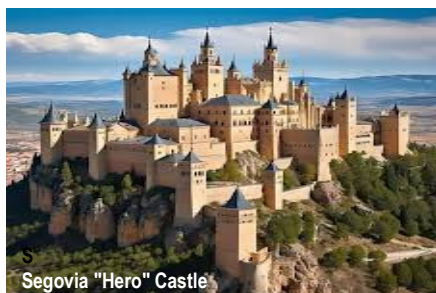
Segovia "Hero" Castle

Hotel : Silken Puerta Madrid or similar (B/L)