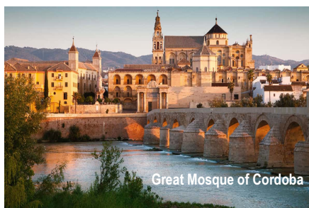
Great Mosque of Cordoba

Hotel : Silken Puerta Madrid or similar (B/D)