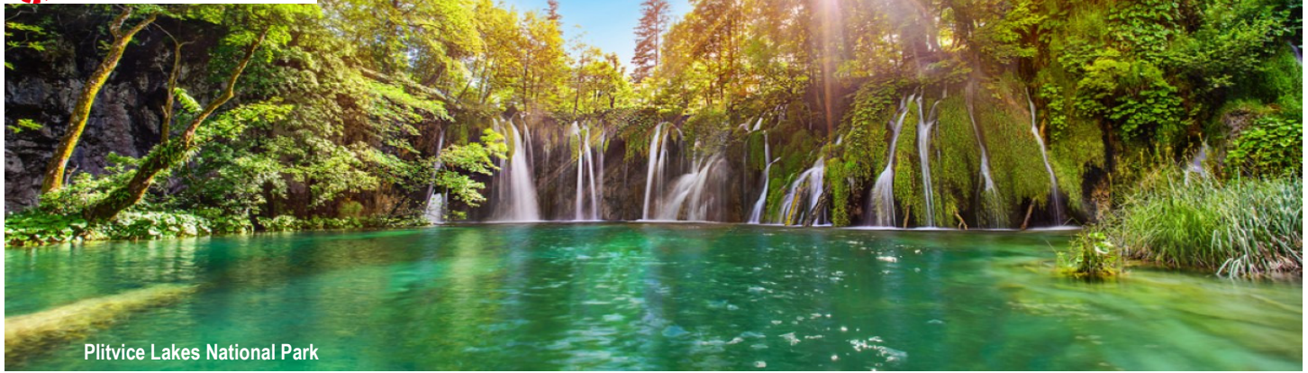
Plitvice Lakes National Park